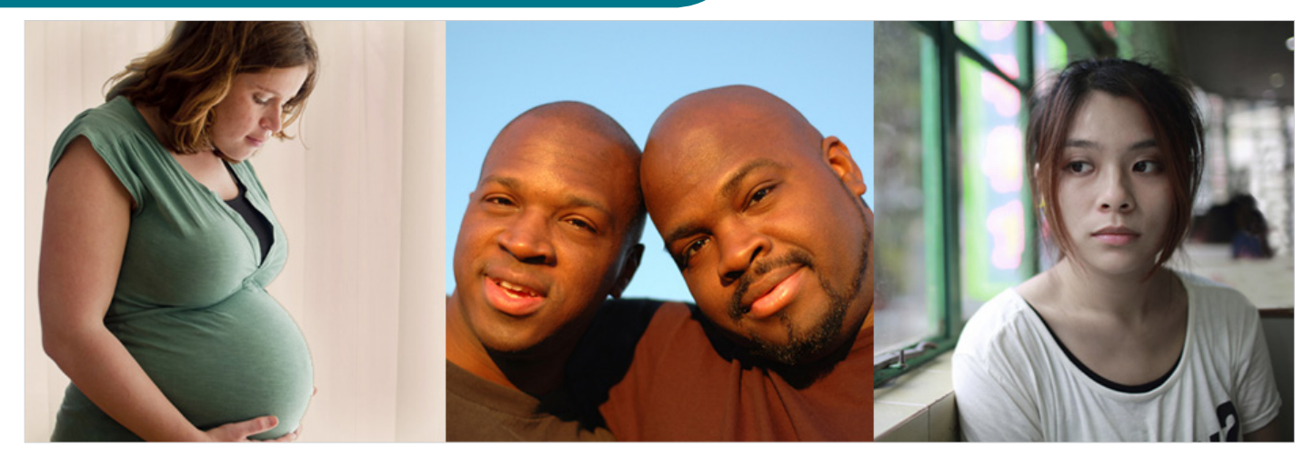
Syphilis is a sexually transmitted disease (STD) that can have very serious complications when left untreated, but it is simple to cure with the right treatment.