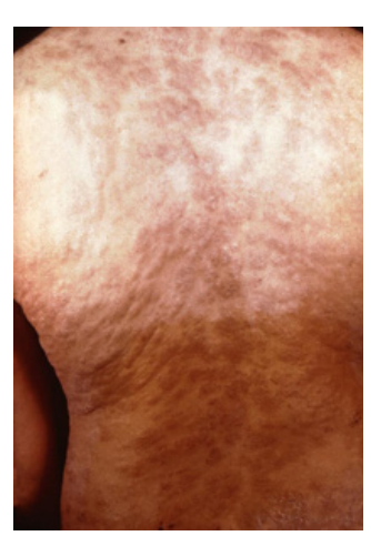
Secondary rash from syphilis

During the secondary stage, you may have skin rashes and/or mucous membrane lesions. Mucous membrane lesions are sores in your mouth, vagina, or anus. This stage usually starts with a rash on one or more areas of your body. The rash can show up when your primary sore is healing or several weeks after the sore has healed. The rash can look like rough, red, or reddish brown spots on the palms of your hands and/or the bottoms of your feet. The rash usually won't itch and it is sometimes so faint that you won't notice it. Other symptoms you may have can include fever, swollen lymph glands, sore throat, patchy hair loss, headaches, weight loss, muscle aches, and fatigue (feeling very tired). The